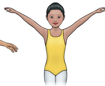
Open Fifth Position