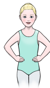
Hands on Waist