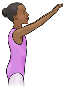
Arms Up in Front