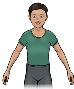
Demi Second Position